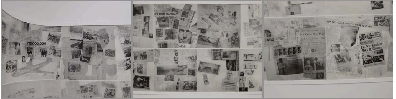
newspaper collages, grounding the connection to the reality of sex-trafficking.